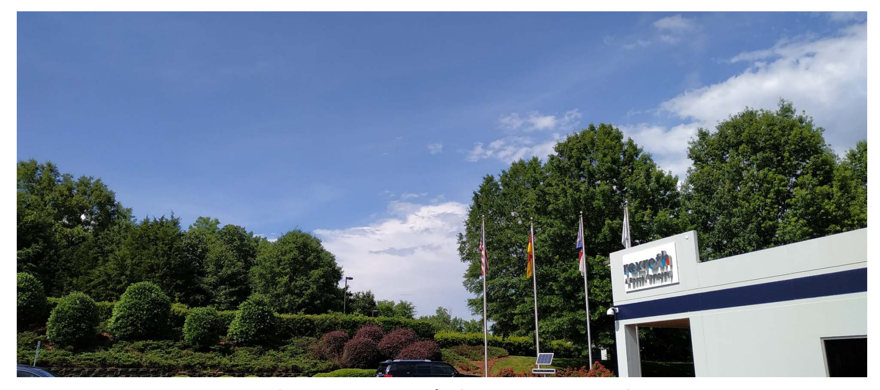
Bosch Rexroth Corporation | Charlotte, USA