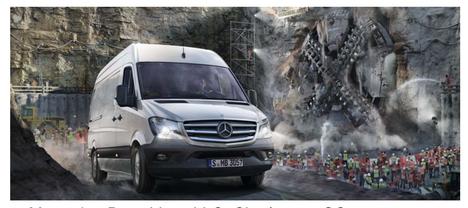
Mercedes-Benz Vans LLC, Charleston, SC