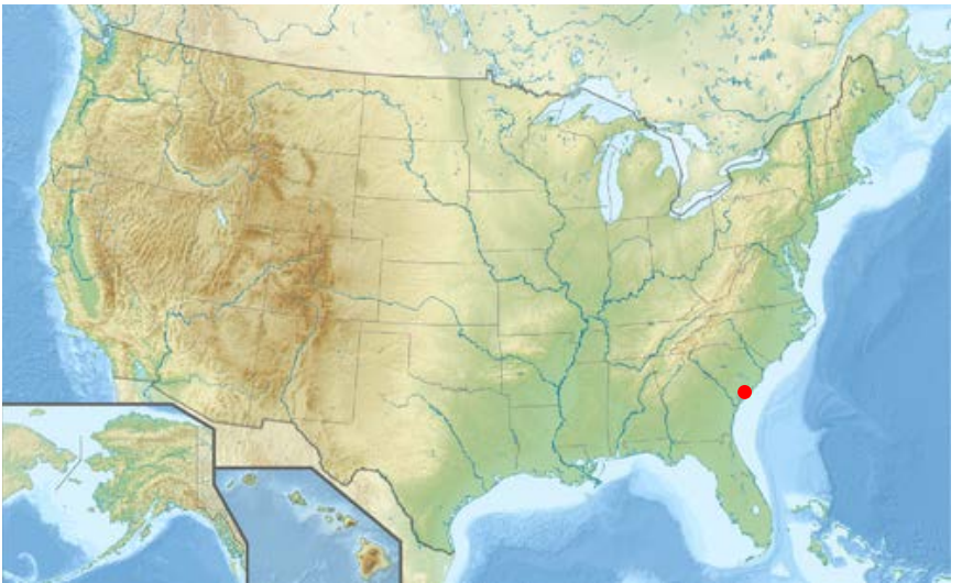
File:Usa edcp (+HI +AL) relief location map.png von TUBS, lizensiert unter CC BY-SA 3.0, https://de.wikipedia.org/wiki/Vereinigte_Staaten#/media/File:Usa_edcp (%2BHI %2BAL) relief location map.png