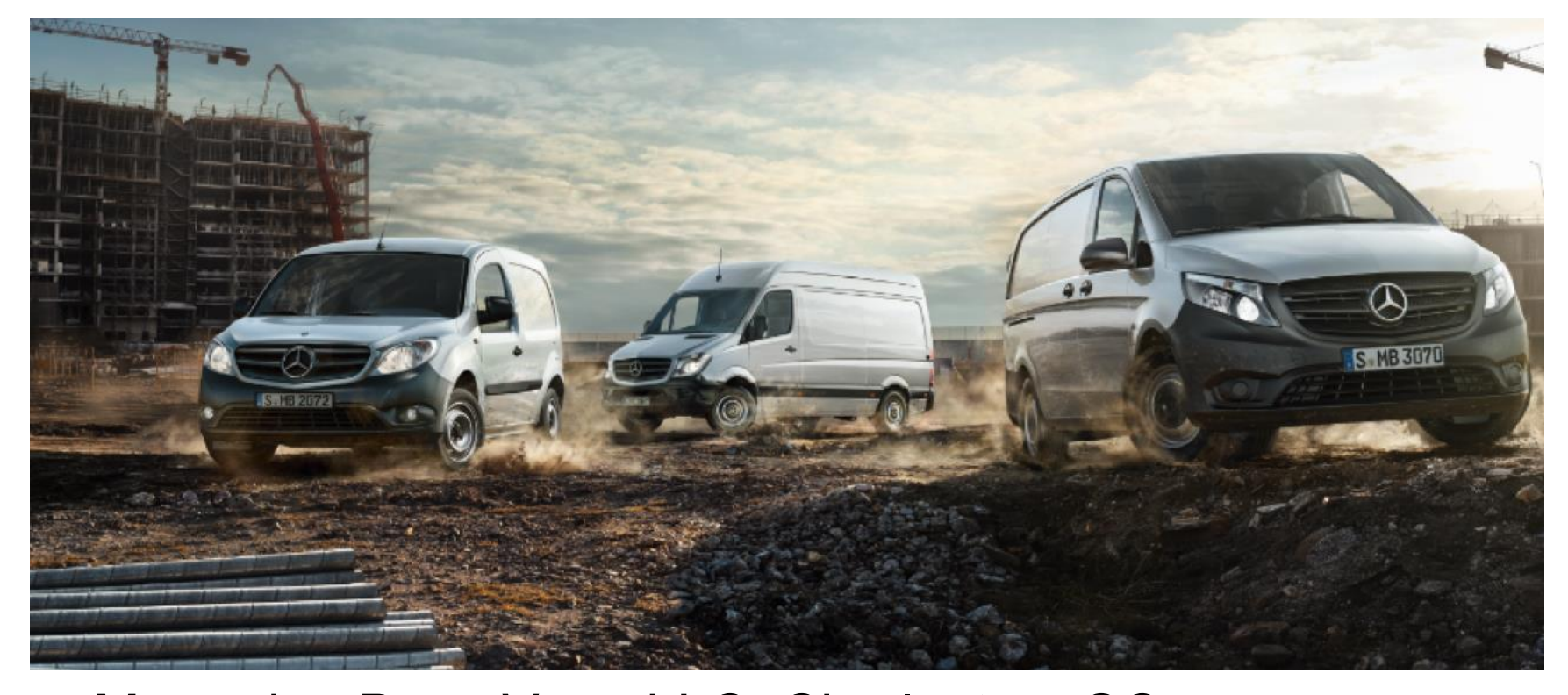
Mercedes-Benz Vans LLC, Charleston, SC