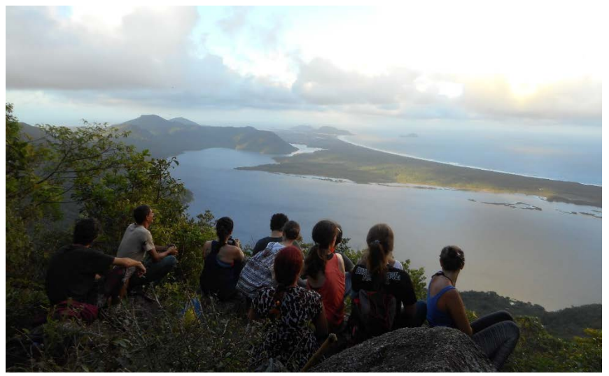
Hoplon | Florianopolis, Brazil